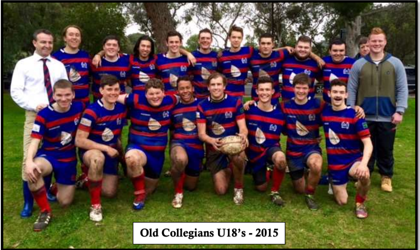
Old Collegians U18's - 2015