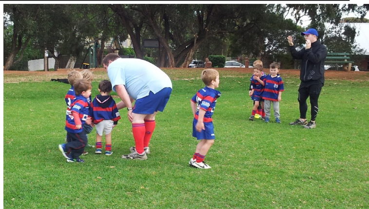
Some very keen OC Joeys!