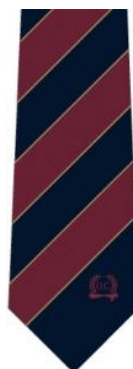
Club Tie $35

Rembrandt tie, in club colours with the logo at the bottom and "Since 1937" underneath it. Also available in "extra long" to allow for great big rugby blokes, please advise us separately if you'd like this option.