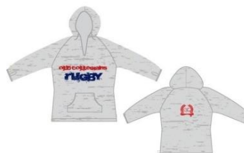
Standard Hoody $60

Traditional cotton long-sleeved jersey in red and blue hoops with the club's 75th Anniversary logo embroidered on the left chest. Sizes run large on this item, you might wish to select one size down.