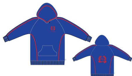
75 th Hoody $50

Rembrandt tie, in club colours with the logo at the bottom and "Since 1937" underneath it. Also available in "extra long" to allow for great big rugby blokes, please advise us separately if you'd like this option.