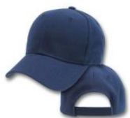
75 th Cap $20

Embroidered brushed cotton baseball cap, with the club's 75th Anniversary logo on the front in red. One size fits all. (Photo is sample only)