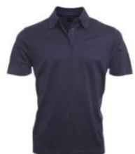
75 th Polo $35

Some items are subject to availability of stock. If we do not have the item you have selected, you will receive a full refund.