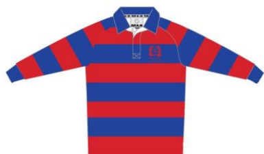
75 th Jersey $50

Traditional cotton long-sleeved jersey in red and blue hoops with the club's 75th Anniversary logo embroidered on the left chest. Sizes run large on this item, you might wish to select one size down.