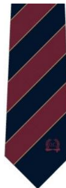
Club Tie $35

Rembrandt tie, in club colours with the logo at the bottom and "Since 1937" underneath it. Also available in "extra long" to allow for great big rugby blokes, please advise us separately if you'd like this option.