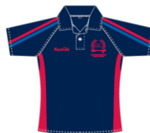
Standard Polo $35

Embroidered brushed cotton baseball cap, with the club's 75th Anniversary logo on the front in red. One size fits all. (Photo is sample only)