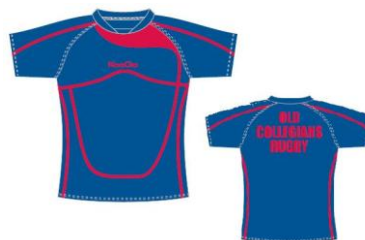
Training Jersey $65

Blue fleecy cotton hoody with club logo embroidered on the reverse and the '75' logo embroidered on the left chest. Sizes run large on this item, you might wish to select one size down. Also available in women's cut.